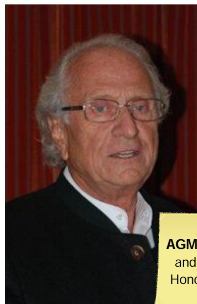
AGM: Speaker and Guest of Honour Michel Roux