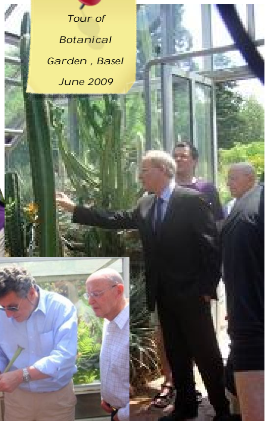
Tour of Botanical Garden , Basel June 2009