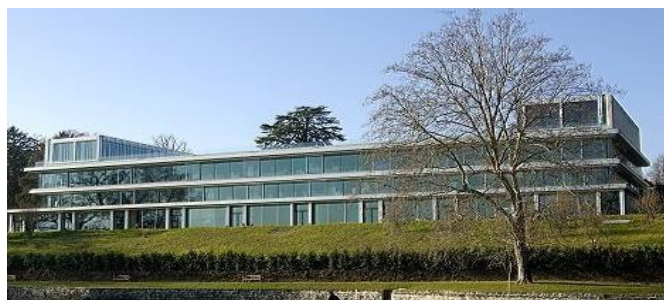
UEFA headquarters in Nyon (VD)

Please register with insead@bluewin.ch before Friday 26th June