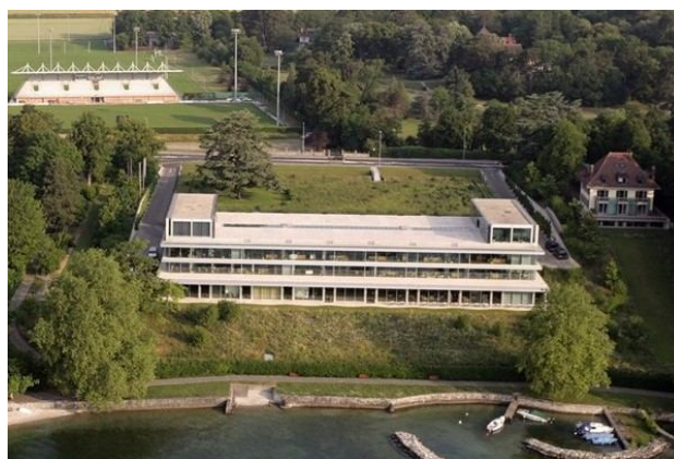
July 3rd: AG at the UEFA in Nyon (VD)