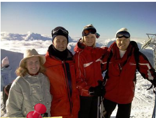
Verbier Ski week end 2009