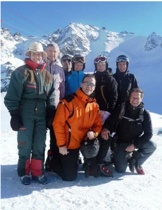
Big smiles in front of mont Fort