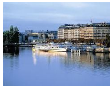
Hôtel de La Paix, Geneva

Dinner-Conference and Annual General Meeting