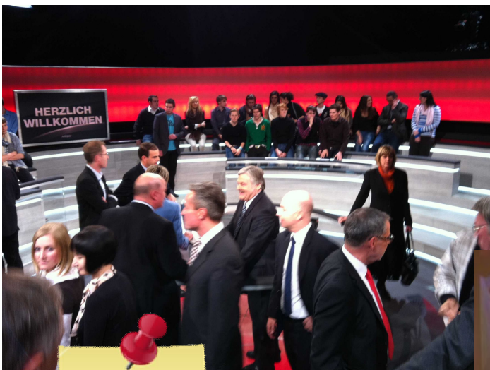
ZH: Visit of Swiss TV / Arena Show, January 2011