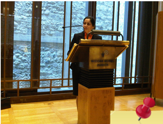
ZH: Luncheon with Monisha Kaltenborn, CEO Sauber Motorsports, January 2011