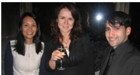
After Work Drinks at Acqua

This event took place at Acqua, a popular Osteria, lounge and bar in the centre of Basel.