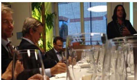
AGM and Spanish Wine Tasting