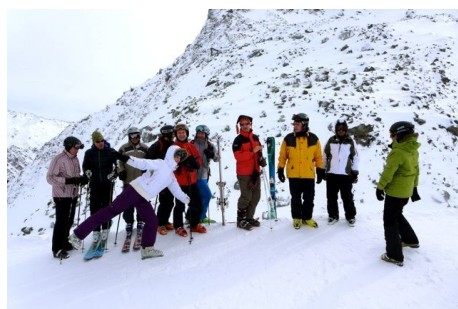
Verbier Ski Week-end

We then enjoyed a fabulous week-end in Verbier with over 50 participants across generations and from all over the world for great skiing, sun and fun.