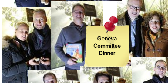
Geneva Committee Dinner