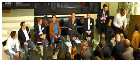
Crowd Funding Panel Debate

drinks event in early January, the year 2013 fully started with the iPEN event about crowd funding in The Hub (article on next page).