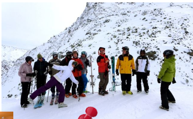
Verbier Ski Weekend